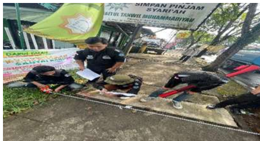
Figure 1. Primary Data Collection at Prof. M. Yamin Street

Prof. M. Yamin Street is a city road that connects various service centers within the city of Pontianak. To evaluate the drainage channels in this area, primary data collected directly at the study site is required. The data collected directly at the study site includes road width, drainage channel dimensions, and the size of the watershed. (catchment area).