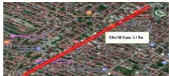
Figure 2. Research Map of Prof. M. Yamin Road

In evaluating the drainage channels in the area, secondary data is required to support this study. The secondary data used includes annual daily rainfall data from 2015 to 2024 obtained from the Pontianak Meteorology, Climatology, and Geophysics Agency (BMKG), location sketches obtained from Google Earth, and relevant literature such as SNI 03-3424-1994 regarding Procedures for Planning Road Surface Drainage. The location sketch on Prof. M. Yamin Street is as follows: